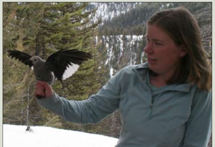
ADULT NUTCRACKER fitted with a radio tag prior to being released.