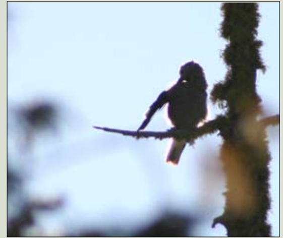
CLARK'S NUTCRACKER #746 preening in the early morning sun in its home range. Home ranges represent secure areas where animals know the locations of the best hiding spots from predators and the most profitable food patches.