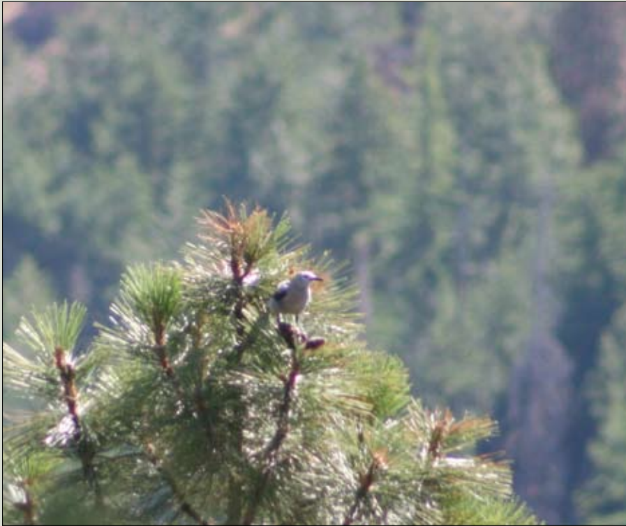
CLARK'S NUTCRACKER #505 —shown here within its home range—transported whitebark pine seeds nearly 33 km between distant harvest trees and cache sites within its home range. However, the home range was located in a ponderosa pine burn, so, despite this dispersal activity, no whitebark pine seeds were established because the caches were placed in a ponderosa pine stand at low elevations.