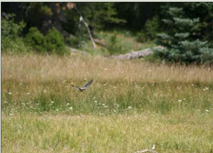
SPACE USE describes how animals use a landscape. For wide-ranging species like Clark's nutcracker, telemetry is generally considered the least-biased way to obtain space use data.