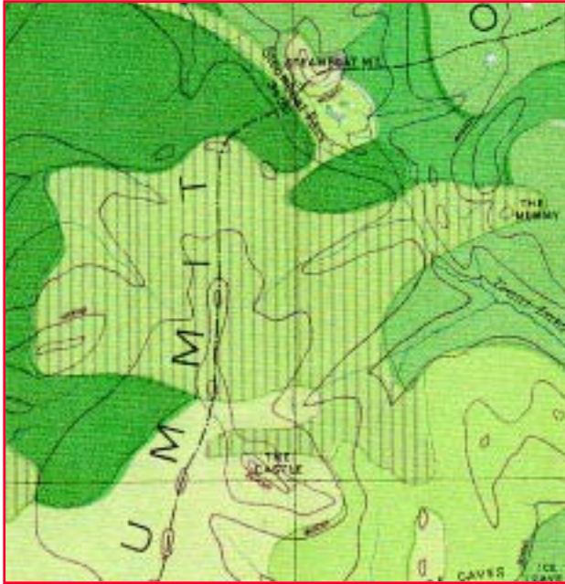
Figure 3 —Large burn (hatched area) shown on the 1899 map of Mt. Rainier Forest Reserve, “south and west of the Mummy and Steamboat Mountain,” where a 5,760-acre (2,310-ha) fire occurred in 1904. In the early 1900s, this was one of the most productive huckleberry fields in the Pacific Northwest. Today’s Sawtooth huckleberry fields are the last remnant.