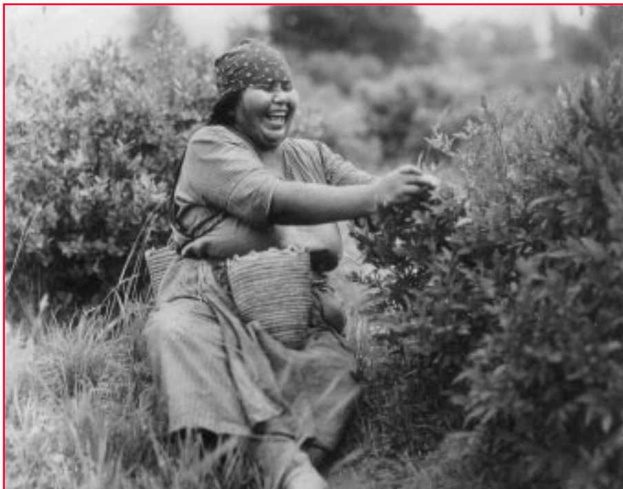
Yakama woman picking huckleberries in the Sawtooth huckleberry fields, on what is now the Gifford Pinchot National Forest.

The National Archives and Records Administration in Washington, DC, has monthly and annual reports submitted by forest reserves,