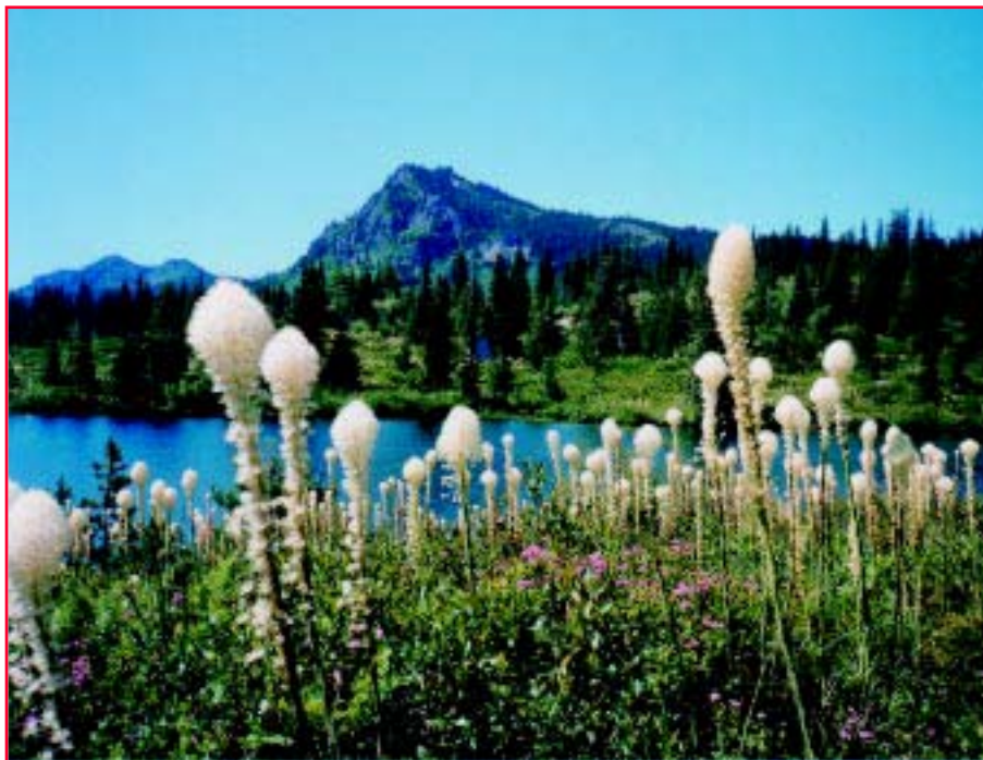
Sawtooth huckleberry fields on the Gifford Pinchot National Forest, showing tree encroachment.