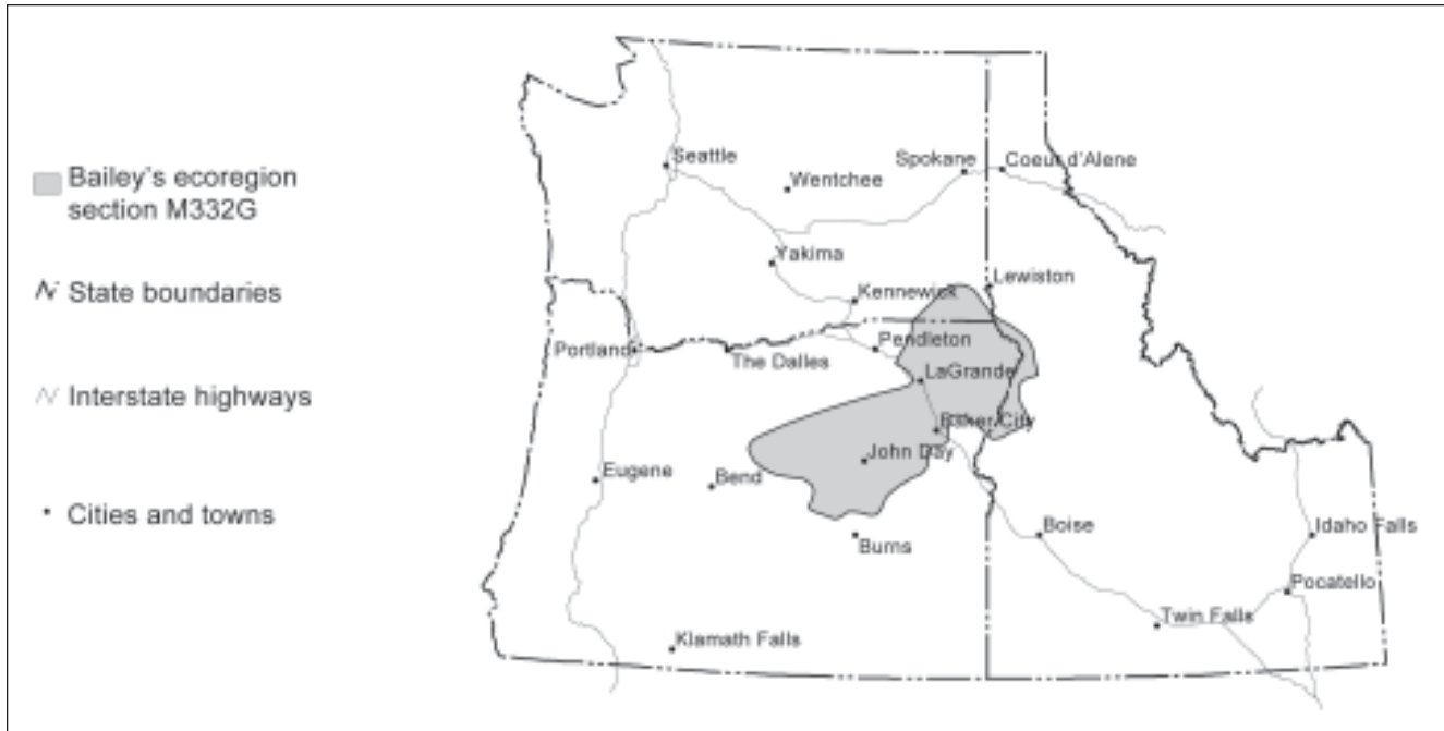
Figure 1—The Blue Mountains section. In the context of the national hierarchical framework of terrestrial ecological units (Cleland et al. 1997), the Blue Mountains are classified as section M332G; the Blue Mountains are the westernmost section in province M332: middle Rocky Mountain steppe–coniferous forest–alpine meadow (Bailey 1998, McNab and Avers 1994).