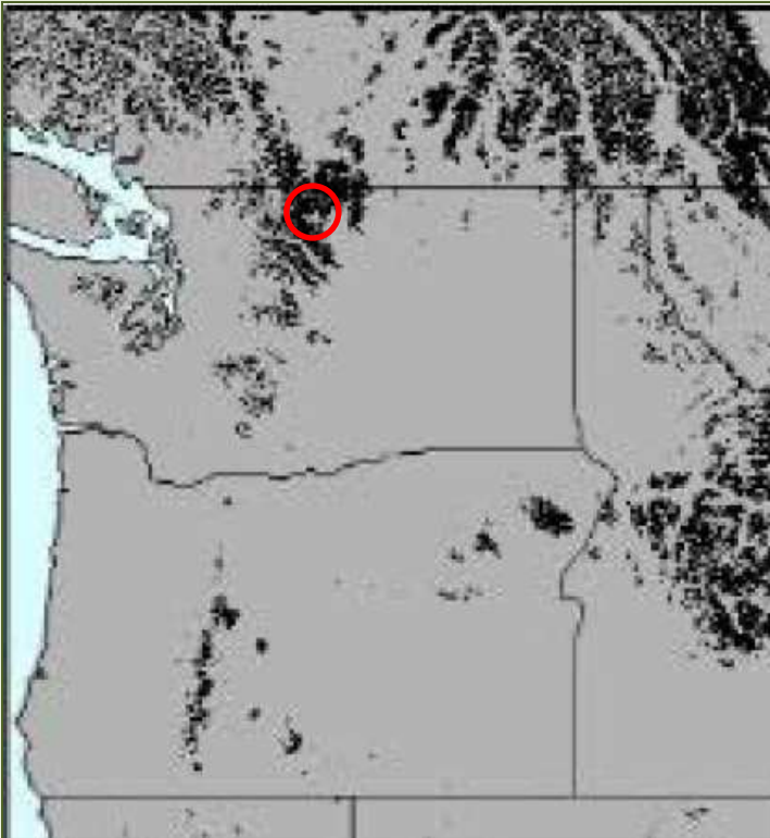
Current Whitebark Habitat